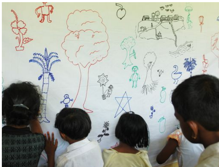
Children draw elements of their environment at the World Environment Day 2009 in Guwahati, Assam, India

Students from primary and secondary school levels were asked to draw a component of their environment on a large piece of cloth, in the participatory drawing event. Students were also given leaf-shaped pieces of paper and asked to put down a wish on climate change. The leaves were pasted on to a poster to look like a tree.