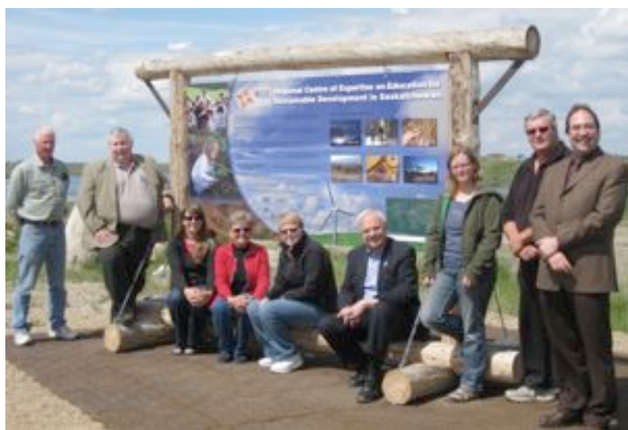
The interpretive panel on RCE Saskatchewan at Craik

On 10 June, an interpretive panel about RCE Saskatchewan was formally unveiled at the town of Craik. The panel, adjacent to the Craik Eco-centre and overlooking a valley and lake, was developed by the Craik Sustainable Living Project using local design and materials.