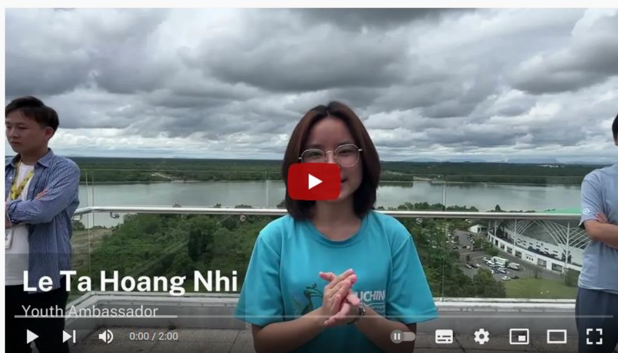
Photo caption 2: Video snippet during ‘International Green Gown Awards’