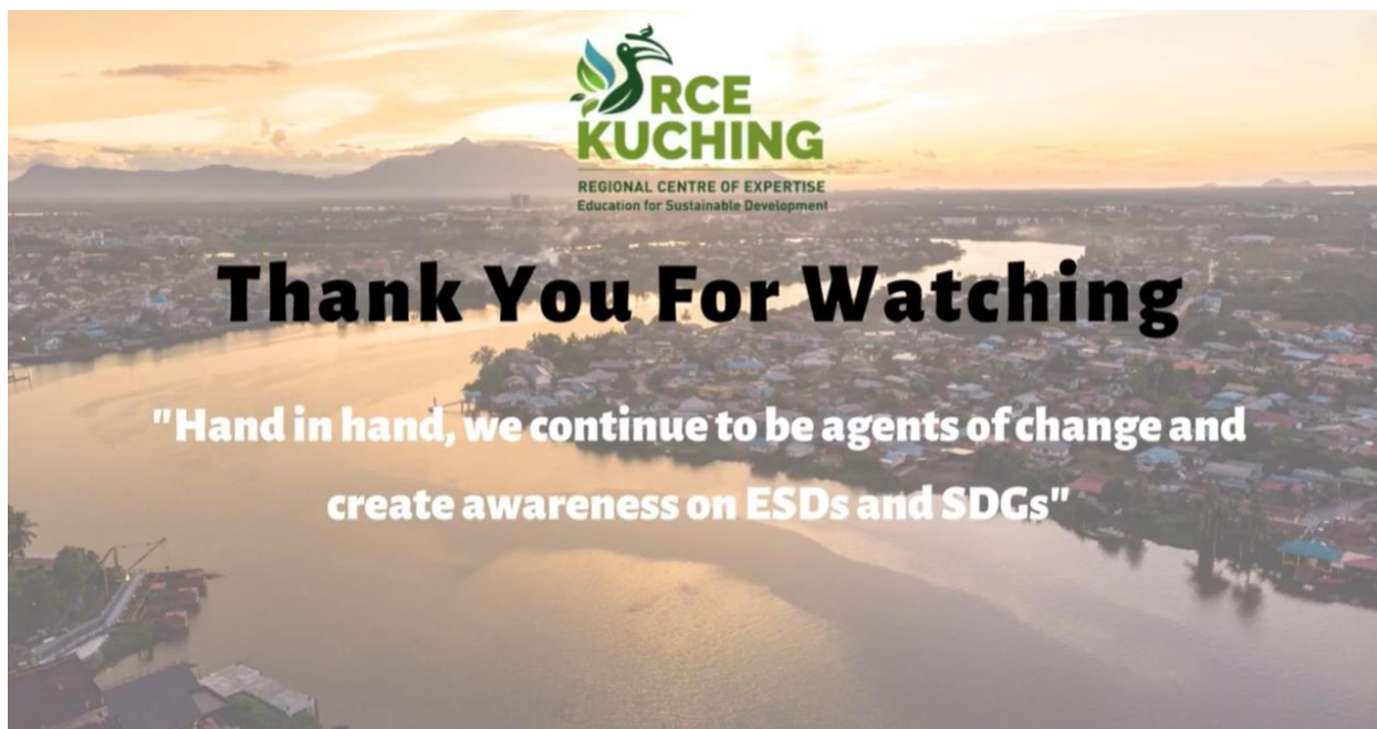
Photo caption 8: Concluding video remark by RCE Kuching for the International Green Gown Awards 2022