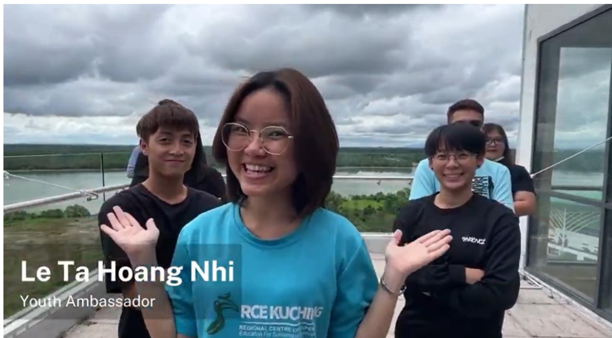
Photo caption 5: Pledging on River Conservation by RCE Kuching Youth Ambassadors

I pledge to bring my eco-bag everywhere I pledge to not use plastic straws I pledge to use products from recyclable materials I pledge to boycott single-use plastic I pledge to practice recycling I pledge to bring my own bottle I pledge to empower others in the "No-Plastic" movement