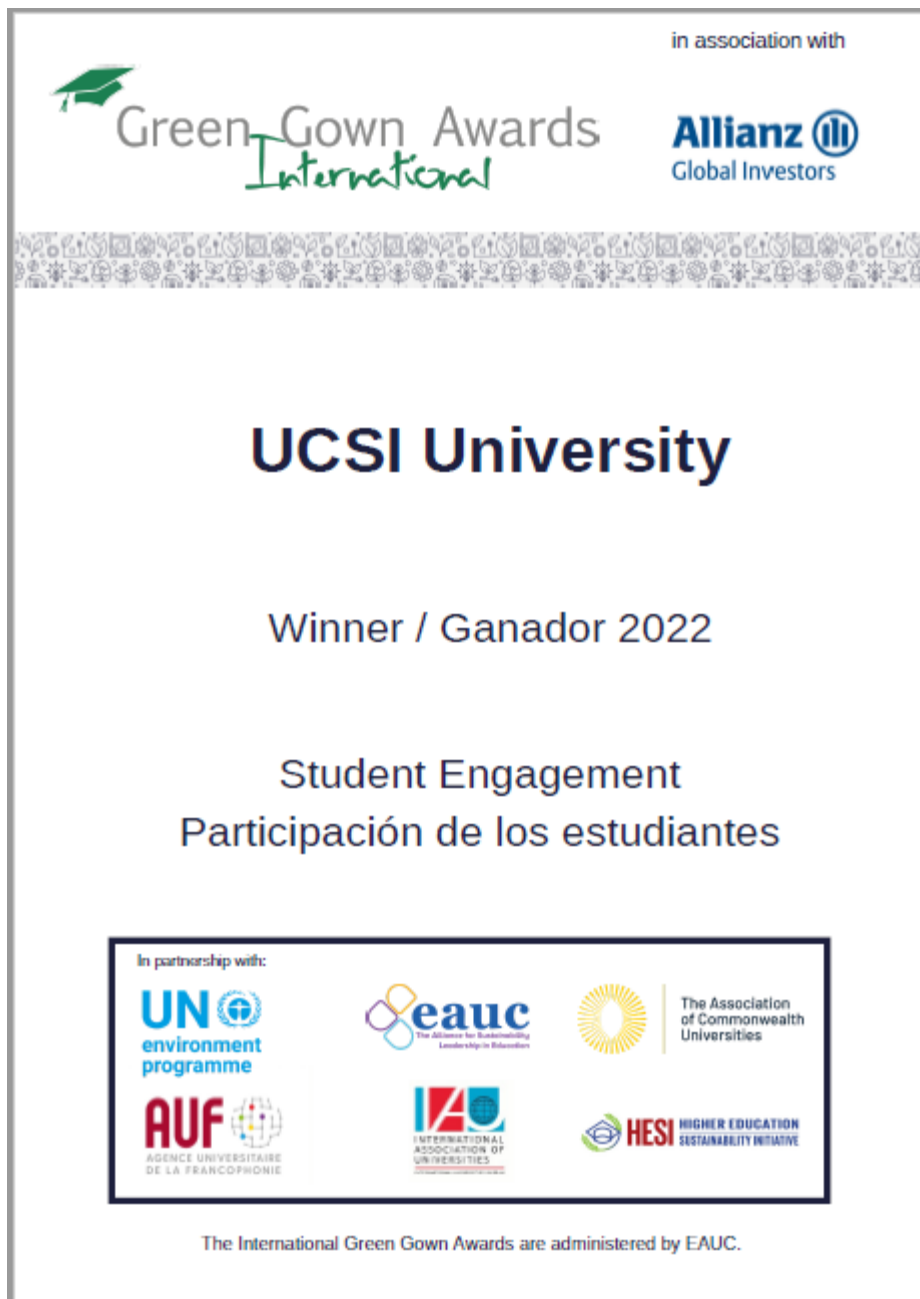
Photo caption 1: Certificate awarded to UCSI University for ‘International Green Gown Awards’ under Student Engagement category