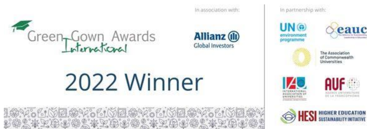
Photo caption 3: International Green Gown Awards Virtual Ceremony, in association with Allianz GI, as part of the UN High-Level Political Forum was held on 6 July 2022 at 1300 EST / 1800 BST @ 2.00 am 7 July 2022.