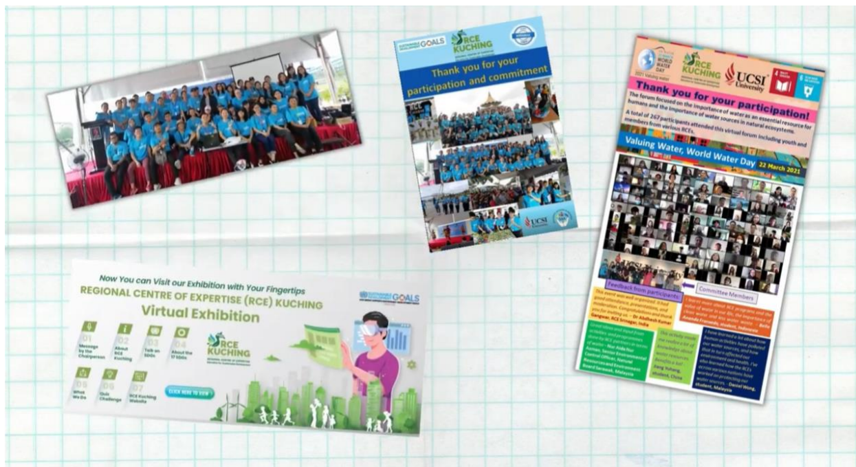
Photo caption 7: Some activities organised by RCE Kuching under “Our River, Our Life” programme