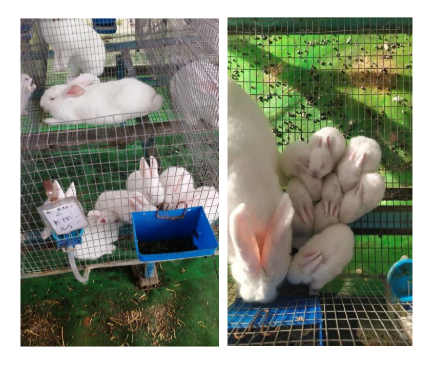
Picture 3: The baby rabbits that have been born from the mother in the first phase of the project