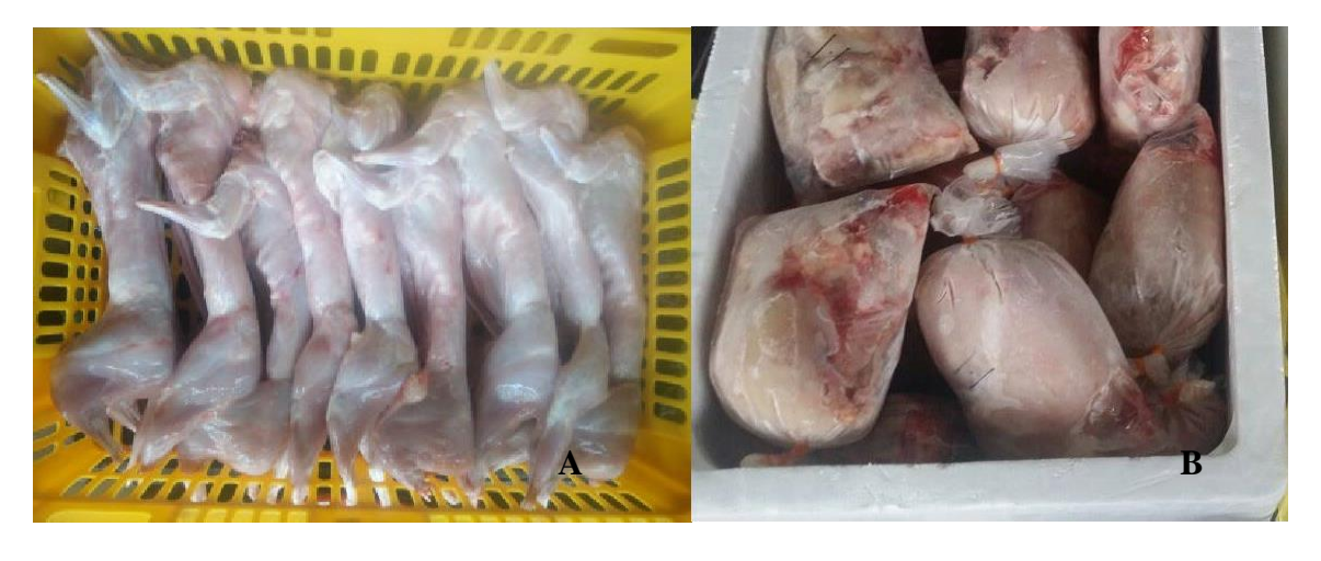
Picture 4: Examples of meat rabbit products. (A) Fresh rabbit meat. (B) Frozen rabbit meat.