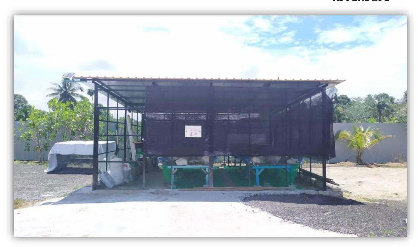
Picture 1: The rabbit hutch currently needs to be expanded to accommodate the newly born rabbits