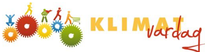
The logo of Climate Everyday

One of the network's projects is ClimateEveryday, a collaboration aimed at increasing public participation in sustainable development.