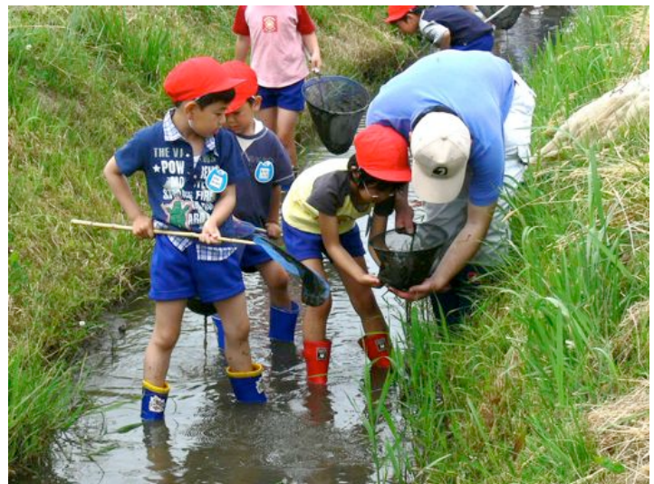
Young children learn about paddy ecosystems

This year, on 14 February, Osaki city held the Ramsar Festival 2010 and invited participants from Changwon City in Korea, to report on a similar wise use approach to wetland and rice paddies. At the event, students of Tajiri Junior-High School reported on their research about biodiversity in rice paddy environments and local cultures. Students of Tajiri Sakura High School made a presentation about the youth conference on biological diversity held in Osaki city in 2009, and talked about their ESD actions in their school. The youth conference is expected to be held again in June.