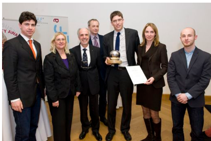
RCE Graz members receive award

The Austrian Sustainability Award is an initiative by the Austrian Federal Ministry of Science and Research, and the Austrian Federal Ministry of Agriculture, Forestry, Environment and Water Management. Awards are given out every two years in eight categories to outstanding projects at higher education institutions in Austria. RCE Graz-Styria received the award under the category of Regional Integration, at a ceremony in Vienna in March.