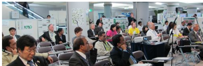
Participants at the UNU-IAS side event at COP 10

The side event ESD and Biological Diversity: How can ESD contribute to CBD? was jointly organised by UNU-IAS, UNESCO and RCEs Cha-am, Chubu, Greater Sendai and Curibita-Paraná, during the CEPA (Communication, Education and Public Awareness) Fair on 20 October 2010. Various ESD activities related to the Convention on Biodiversity were presented from international, national and local perspectives and the participants reaffirmed the significance of communication, education and awareness-raising as instruments for the promotion of ESD as well as the achievement of the three objectives of the Convention.