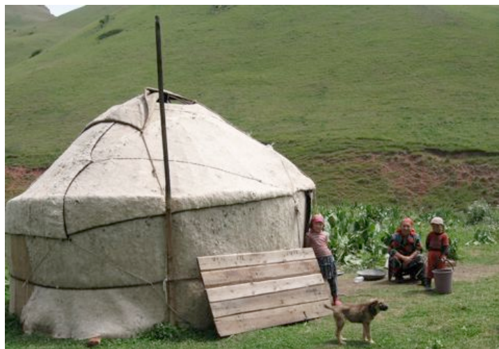
A family in the Naryn region of Kyrgyzstan

governance, human rights and introduction to education for sustainable development.