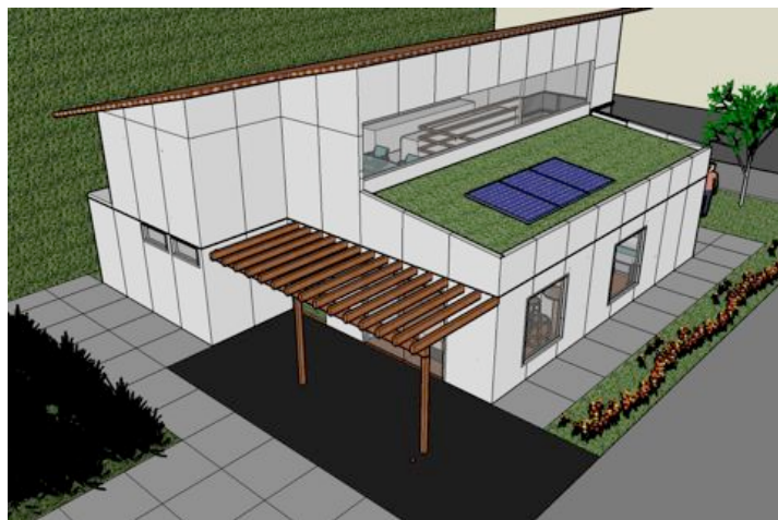
RCE Curitiba-Paraná's new base