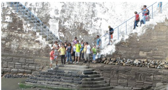
On a biodiversity walk along the Azorean coast

The winning walking tour was created by Angra do Heroísmo's outreach office Culturangra and the University of the Açores, both active RCE member organisations. The tour includes storytelling and interpretation of natural and cultural history and highlights the local uses of aquatic and coastal plants and animals. Visitors to Angra's city beach, Prainha, were taken on the walk by Culturangra throughout last summer's year of biodiversity. Educators from three Azorean islands explored this walking tour as part of a workshop hosted by RCE Açores in September and are encouraged to make use of the printed guide to take their own students on the tour. The guide, in Portuguese, is available on the RCE Açores website.