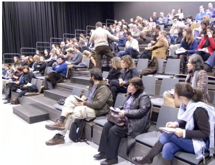
At the kick-off conference of Sustainability in Schools

80 teachers and representatives of the schools' board of directors. Voluntary pilot-schools are currently collecting primary data on consumption, the discussion on data collection methods and a template will continue until June 2011, and a training session and workshop for teachers is foreseen. The implementation of best practices will start in October 2011 and the final report will be available in July 2012.