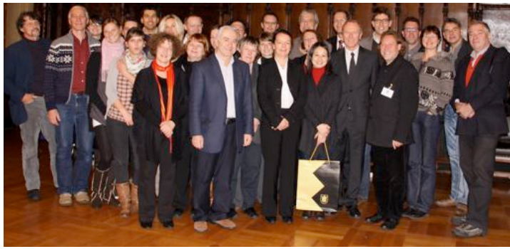
Participants at the meeting of European RCEs

See www.bene-muenchen.de for a full report.