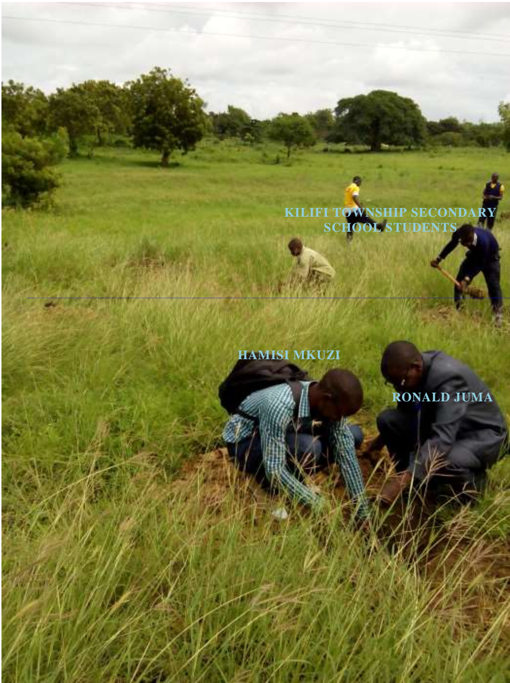
KILIFI TOWNSHIP SECONDARY SCHOOL STUDENTS