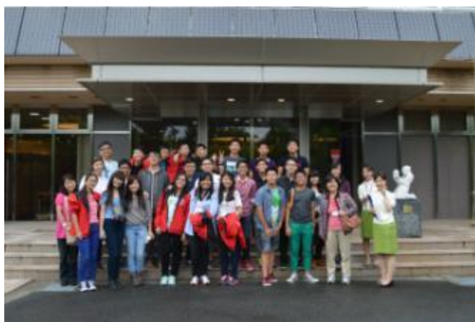
Yamada Bee Farm's headquarters