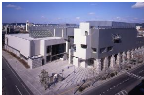
Okayama Prefectural Museum of Art