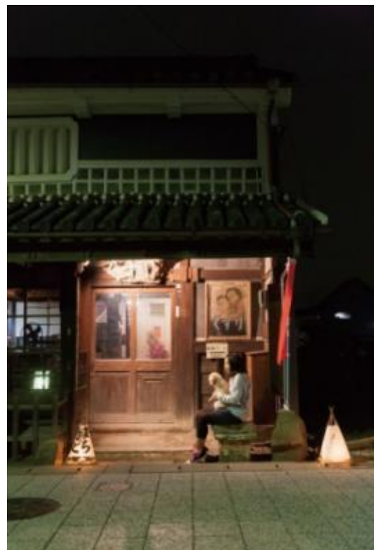
State of the street corner Museum