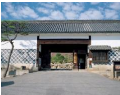
Hayashibara Museum of Art