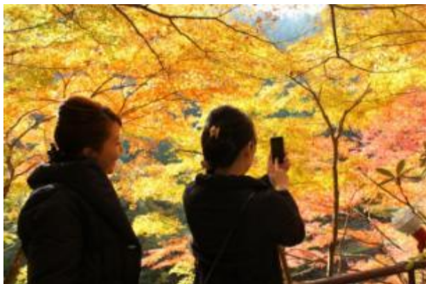
State of autumn leaves