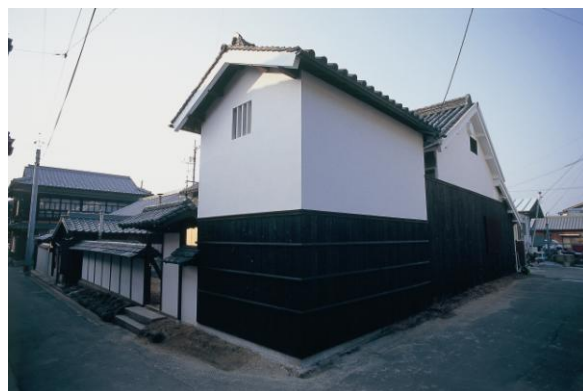
Art House Project “Kadoya”