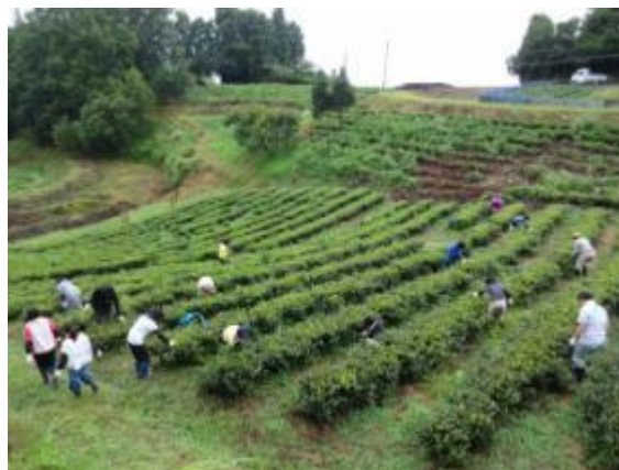
A Project to Resurrect the Ruined Tea Gardens