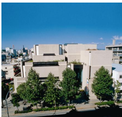
Okayama Orient Museum