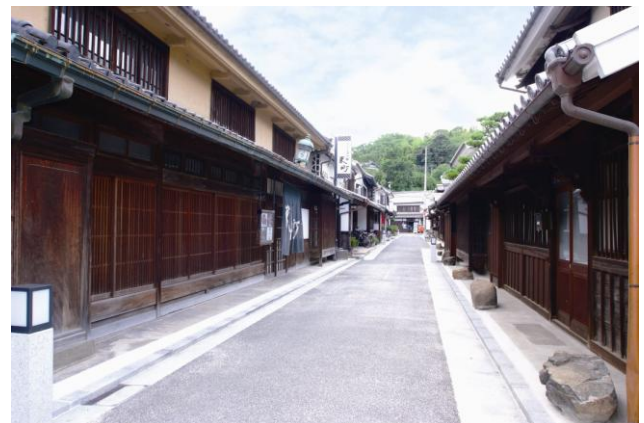
Kurashiki Bikan Historical Area