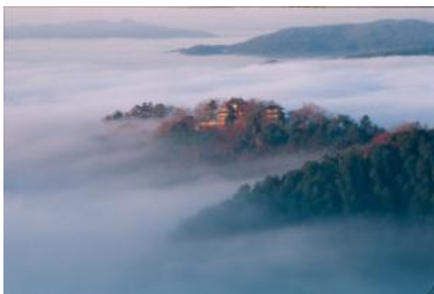
Bicchu Matsuyama-jo Castle

Matsubara-cho in Takahashi City has long been a tea producing area; however, due to the aging of society and depopulation, the number of deserted cultivated tea gardens has been increasing. The Support Team for the Resurrection of the Ruined Tea Gardens has been developing activities to resurrect those disused tea gardens, protect the scenery of the meso-mountainous region, and revitalize the local agriculture.