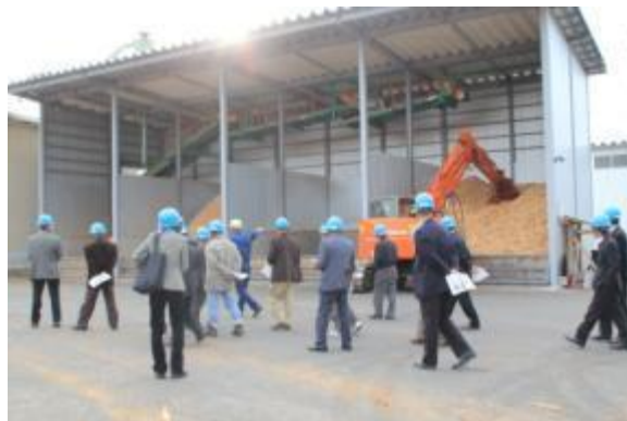
Maniwa biomass integrated base