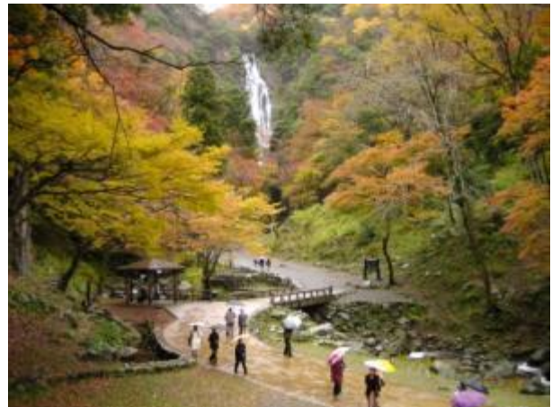
State of autumn leaves