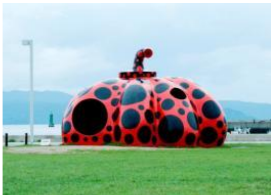
“Red Pumpkin”©Yayoi Kusama,2006 Naoshima Miyanoura Port Square

In the southern part of the island, art facilities in which the nature of Setouchi, architecture, and contemporary art are fused have been developed since 1989, such as Chichu Art Museum, Benesse House Museum, and Art House Project, through the contemporary art activities by Benesse Art Site Naoshima. Such activities have been creating special sites you can only experience there. Through such activities continued over the past 20-some years, the island has been receiving high acclaim as the island having a high level of cultural traits both at home and abroad.