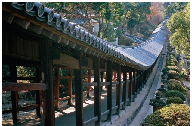
Corridor (prefecturally-designated cultural properties)