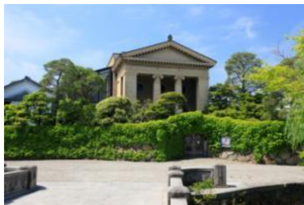
Ohara Museum of Art